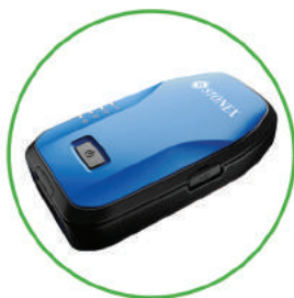
High precision positioning

Precision Farming, Mapping, GIS data collection, environmental agencies, forestry are just a short list of the fields where Stonex S500 will give a decisive impulse to the productivity and to the quality of the positioning data: and using the already existent devices, as Smartphones and Tablet with Android, iOS, Windows operating system.