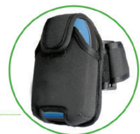
Hands free design